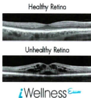
(Detailed iWellness photo)